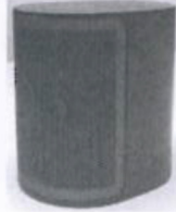
Figure 1: Example photo, colours may vary

Equipment: Wireless Speaker Brand: Bang & Olufsen Model name: Beoplay M3 Object of equipment: