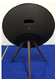
Figure 1: Example photo, colours may vary

Equipment: Wireless Speaker Brand: Bang & Olufsen Model name: Beoplay A9 3rd Generation Object of equipment: