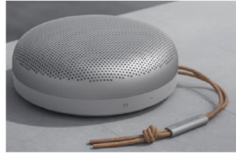
Figure 1: Example photo, colours may vary

Equipment: Bluetooth Speaker Brand: Bang & Olufsen Model name: Beosound A1 2nd Gen Object of equipment: